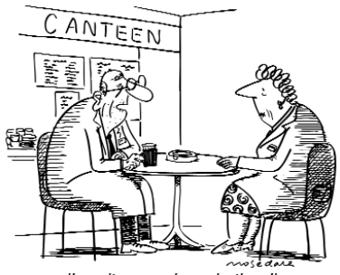
'I can't remember whether I'm retiring or training today!'

The new Age Discrimination Regulations came into effect on the 1st October 2006 amidst an alarming lack of awareness or understanding of the way in which these new laws will affect employees of all ages and employers. Recent surveys by Help the Aged, and other organizations revealed that both employers and employees either had no idea the regulations were coming into effect on the 1st October or, if they did, did not understand how the law had changed.