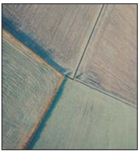
Know where you stand — Register your land

In order to prepare for this the Land Registry have been updating their systems and in particular by virtue of the Land Registration Act 2002, which has been coming into force little by little, title deeds have dematerialised and your ownership of "55 Acacia Avenue" is merely a byte of information on the Land Registry central computer! No more parchment, sealing wax and whys or wherefores!